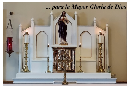
... para la Mayor Gloria de Dios