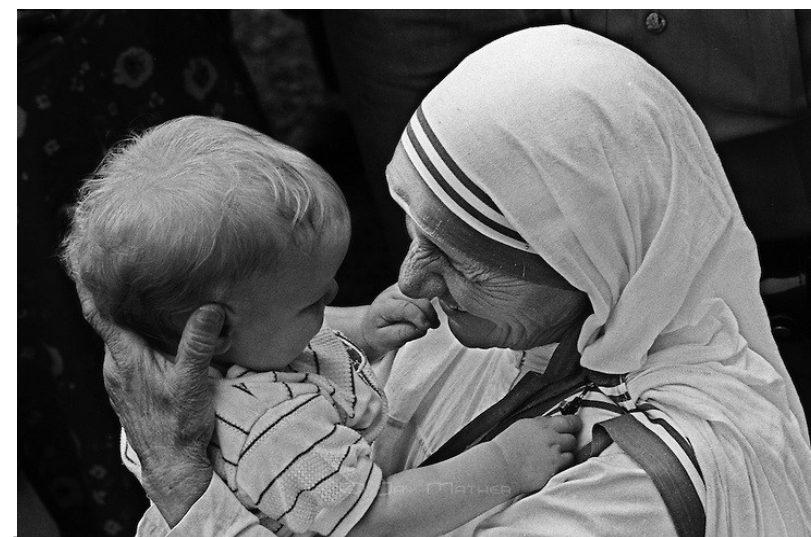
For great is the might of the Lord; he is glorified by the humble. Sirach 3:20

For anointing of the sick, receiving the Eucharist while homebound/in the hospital, hearing of your confession, or special prayers and/or visit from Father please call the church office.