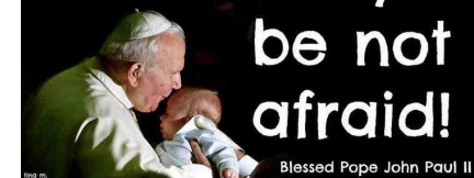
Blessed Pope John Paul II